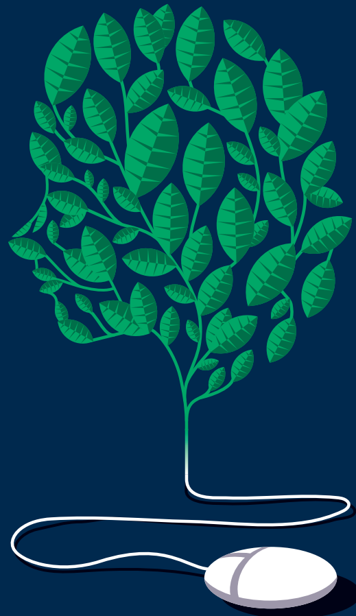
Illustration by Ben Wiseman